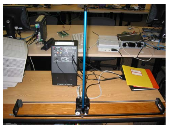
Figure 3 – Quanser System Inverted Pendulum

The last pieces of hardware to mention are primarily used in the third course in the sequence. This course covers performance engineering of real-time and embedded systems. To motivate the need for system tuning of real-time systems we use the control of physical systems. The two systems we choose for the laboratory are from Quanser Systems [8]. We selected their inverted pendulum and ball and balance beam systems shown in Figures 3 and 4 respectively. In the third course the students also experiment with hardware/software co-design on a Digilent Spartan 3 FPGA board [2] shown in Figure 5. There is one FPGA system at each student station.