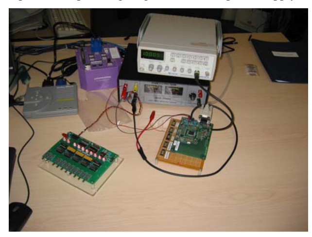
Figure 2 – M68HC12 Microcontroller, interface board, LED-Switch Board, Signal Generator and Power Supply.

For the experiments involving programming a microcontroller, each station is also provided with a Motorola 68HC12 board, a custom designed interface board on which is mounted the microcontroller board, a custom binary LED-switch board for elementary binary input and output, a signal generator and a power supply.