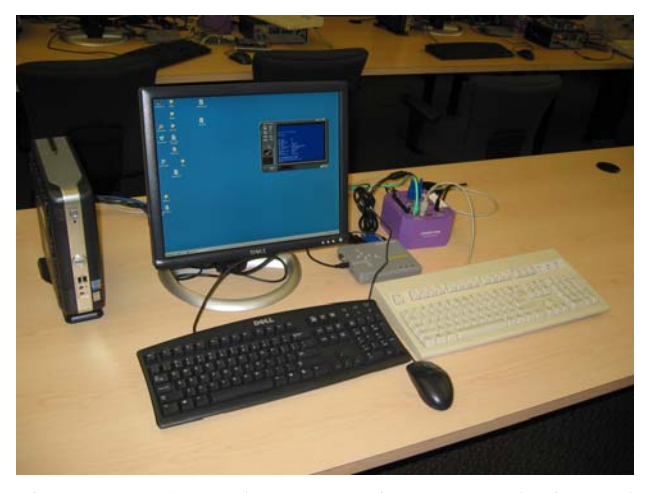
Figure 1 – PC Development environment and Diamond Systems pc-104 board target system showing picture-in-picture target system console.

The studio lab developed for these courses consists of twelve student stations and an instructor's station. The instructor's station is configured with classroom control software that enables the capture, control and display of any of the student stations on the classroom video projector. Each student station is positioned to allow a pair of students to work together. Each station has a modern personal computer for software development and a 486-based single board computer as a target system. We are using a Diamond Systems [1] pc-104 board with timers, A/D converters, D/A converters, and digital I/O capability for the target systems. See Figure 1.