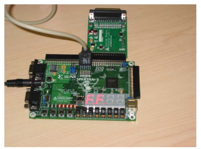
Figure 5 – Digilent Spartan 3 FPGA Board