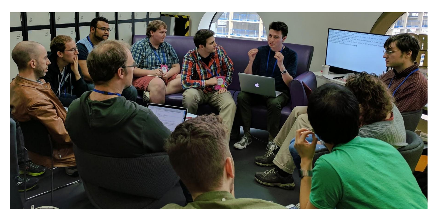
Reaching out to the community at MozFest 2016 in London, England

To achieve these goals, we created public discussions on our project page, conducted direct interviews with prominent community members, attended a conference where we discussed the products with potential end users, and sent out periodic newsletter to spread awareness of new features and solicit feedback.